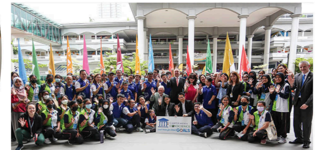
Campus With A Conscience Local Actions For Global Goals - This event showcased Sunway's commitment to inclusivity. Over 50 charities, non-governmental organisations (NGOs), and global brands, along with Malaysia's first sustainable ambulance participated. The event also featured pre-loved items, book sharing booths, and a Wishing Wall, fulfilling wishes for 280 children from local orphanages and refugee homes.