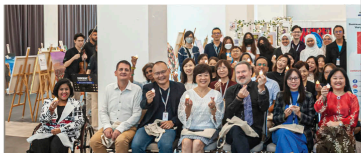
WeMind Mental Health & Suicide Prevention Campaign - The Mental Health and Suicidal Prevention Campaign was held in collaboration with multiple artists, professionals, as well as students on campus, with the aim of spreading mental health awareness, sharing stories and showing support towards the Sunwayian community.