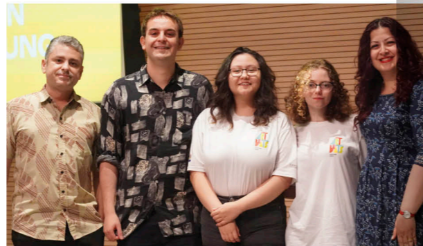
The Art Beats Festival 2023 - A collaborative effort between Sunway University and Lancaster University, showcased a diverse range of artistic expressions and celebrated 15 years of partnership between these institutions, reinforcing the connections between Lancaster Institute for Contemporary Arts (LICA) and Sunway's School of Arts.