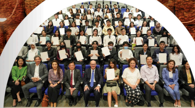
Sunway TES and ICAEW Partnership Prospers - Sunway TES Malaysia and the Institute of Chartered Accountants in England and Wales (ICAEW) have successfully renewed their partnership. It also marked the start of the partnership with Sunway TES Iskandar College. Additionally, Sunway TES presented the ICAEW Global Accountant Scholarship Award, marking 854 scholarship recipients since the start of their collaboration.