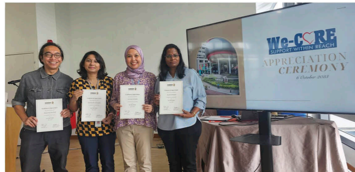
We-CARE Appreciation Ceremony - An Appreciation Ceremony was held to show our gratitude towards academic staff members who work hand-in-hand with the counselling team to create a nurturing and inclusive learning environment for all students.