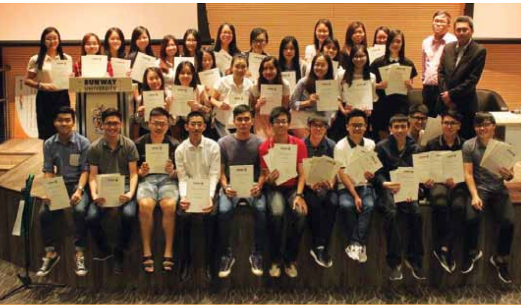
44 BSc (Hons) in Actuarial Studies students passed the Society of Actuaries (SOA) Professional Exams making them eligible for professional credentials.