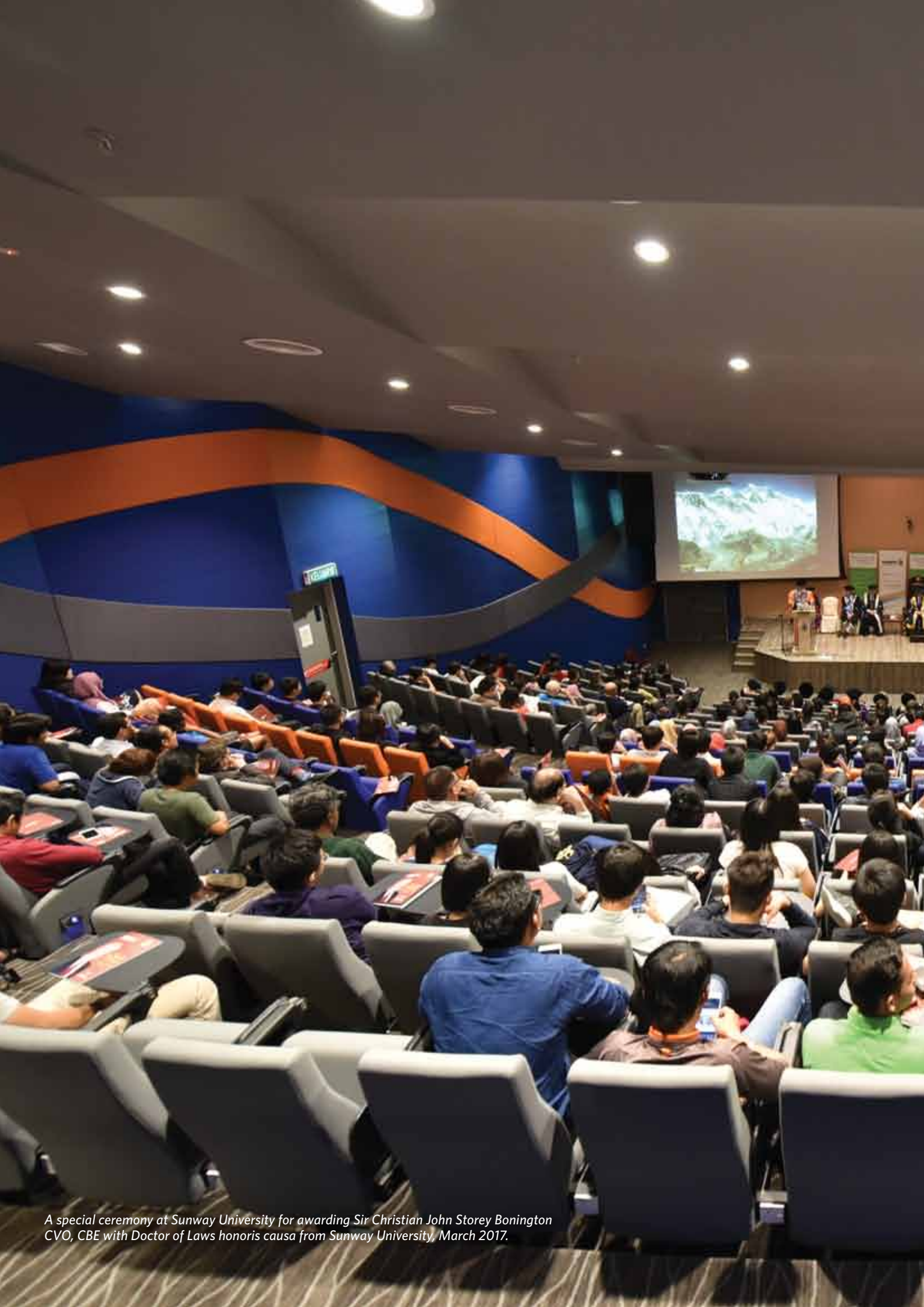
A special ceremony at Sunway University for awarding Sir Christian John Storey Bonington CVO, CBE with Doctor of Laws honoris causa from Sunway University, March 2017.