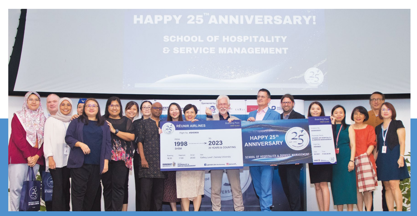
25 Years! The School of Hospitality and Service Management celebrates its Silver Jubilee