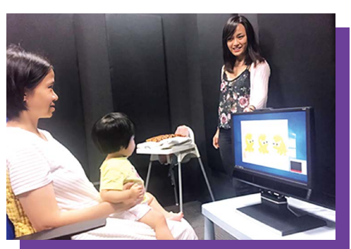
Eye tracker being used to track attention and study visual perception