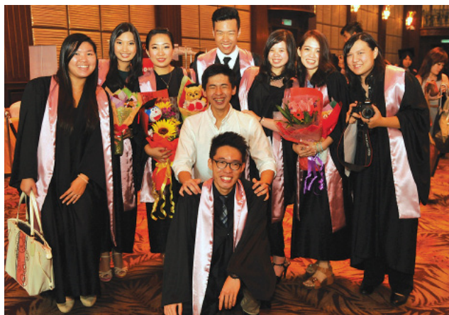
Sunway University Business School Graduates