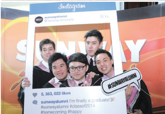
Sunway University's graduation photo booth