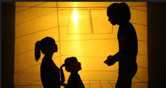
Scene from Bayang – the father told his children about their missing mother, Si Majag