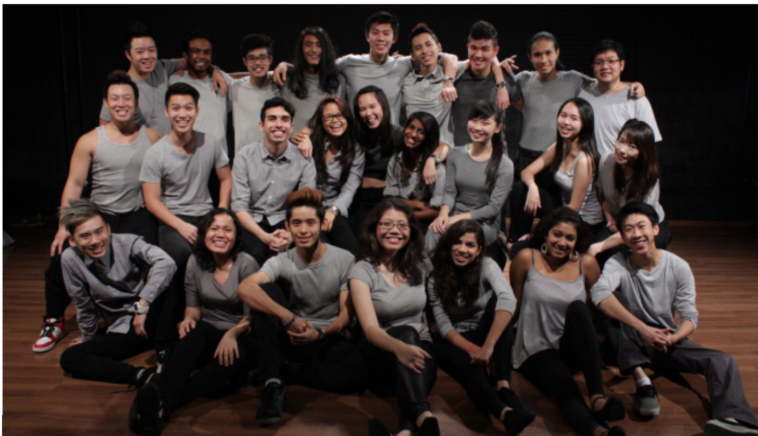
The Diploma in Performing Arts March 2012 cohort