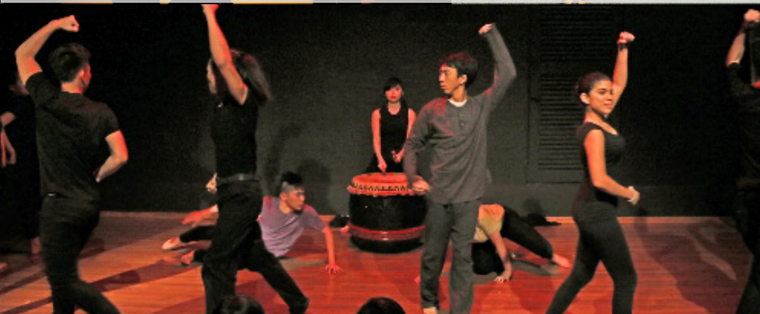
Scene from Face of Faith , a physical theatre performance including dance and music