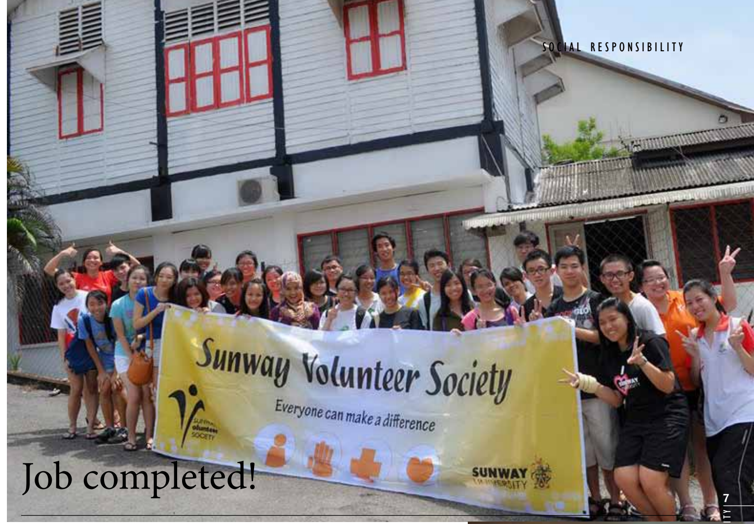
Sunway Volunteer Society students delighted that the job was completed finally

Every job must be completed, with no unfinished task.