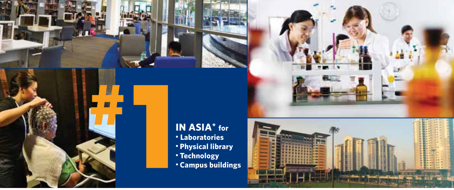
* Student Barometer Survey Entry Wave 2017 IN MALAYSIA* for Overall aspects of institutional experience

The Student Barometer Survey Entry Wave 2017 tracked feedback from 129 institutions across the globe in the last quarter of the year. Sunway ranked among the leading institutions in Asia and Malaysia in several categories.