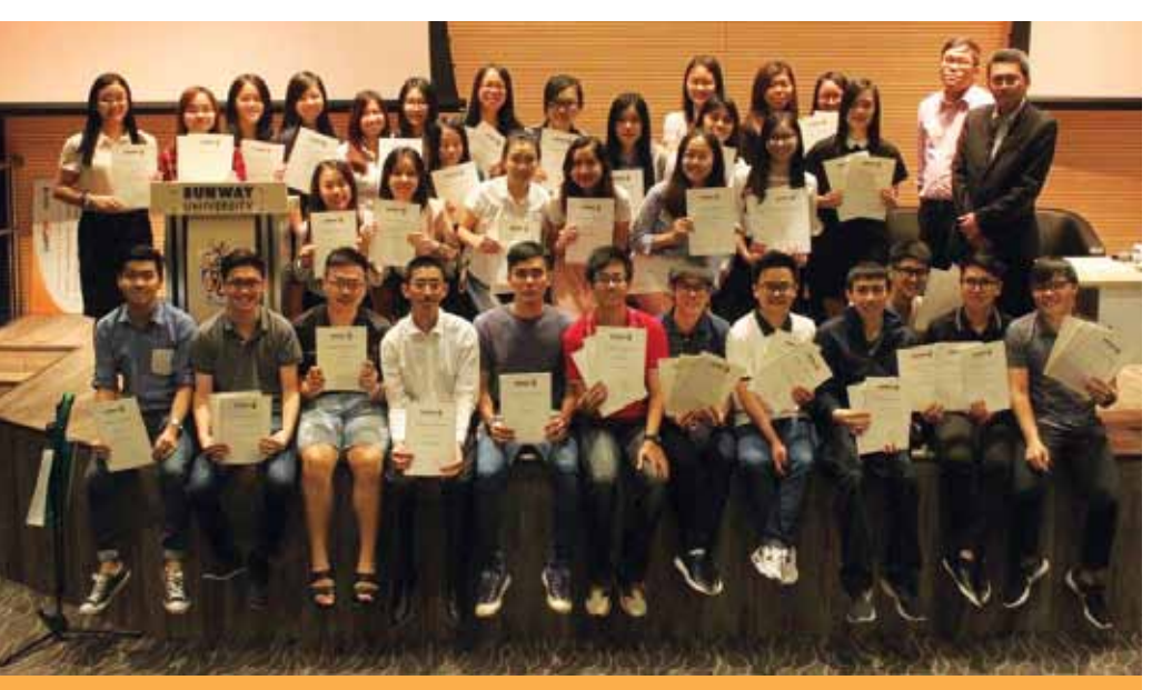
44 BSc (Hons) in Actuarial Studies students passed the Society of Actuaries (SOA) Professional Exams making them eligible for professional credentials.