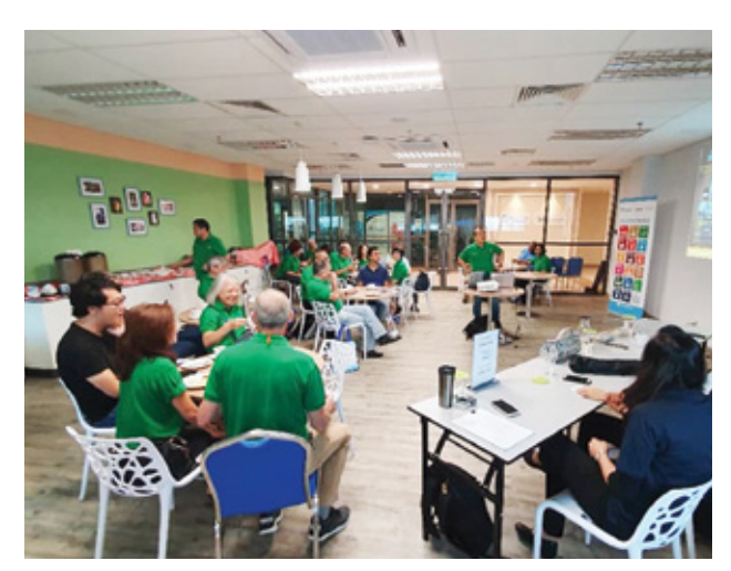
Jeffrey Sachs Center on Sustainable Development hosted the Rotary Club of Bukit Kiara Sunrise at the Sunway University Post Graduate Lounge.