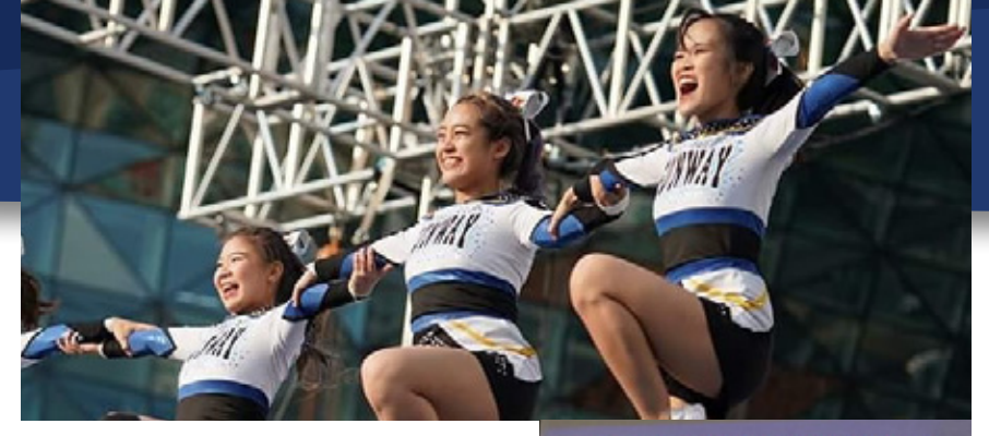
The Sunway University Cheerleading team, representing Malaysia, emerged as Champions at the 2<sup>nd</sup> Asian University Cheerleading Championship in South