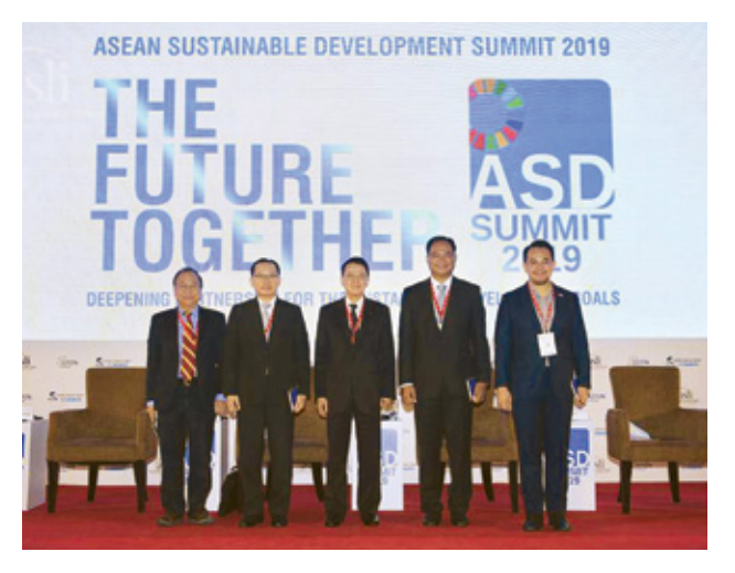
ASEAN Sustainable Development Summit 2019 at the Sunway Resort Hotel & Spa.