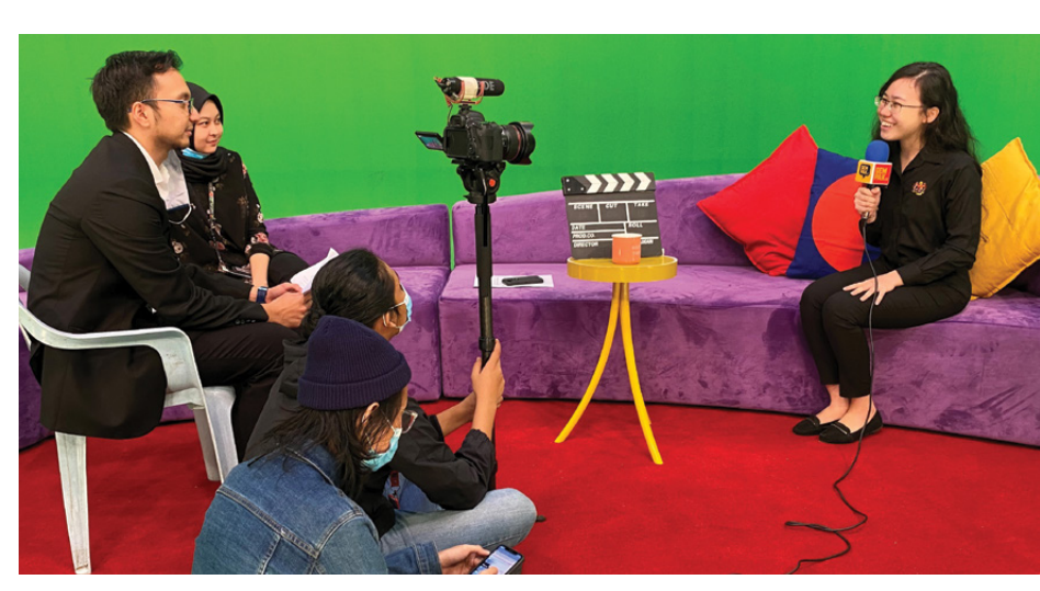
Interview at ASTRO