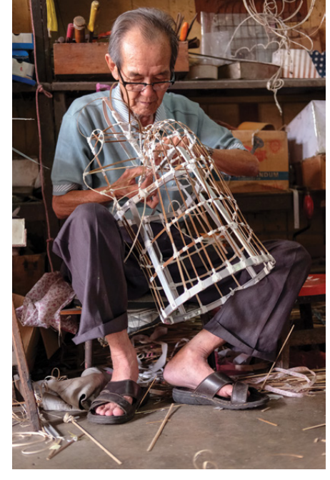
Lion head making

They secured funding at their first attempt from the Sunway University Internal Grant in 2018 and later the Fundamental Research Grant Scheme from the Ministry of Higher Education in 2019.