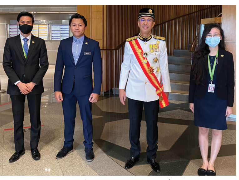
With YB Senator Tengku Datuk Seri Utama Zafrul Tengku Abdul Aziz, Minister of Finance (second from right)