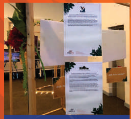
Information and stories of the Malayan tiger were shared with visitors