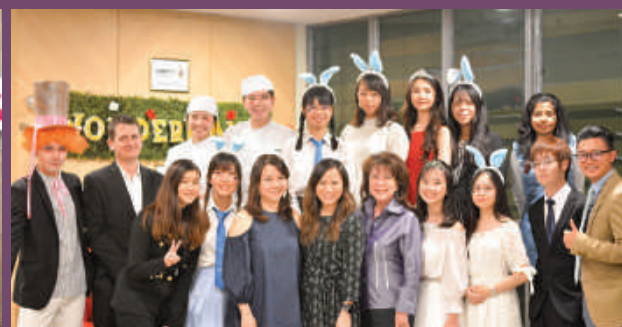
VIPs and invited guests with the team behind Wonderland Charity Dinner