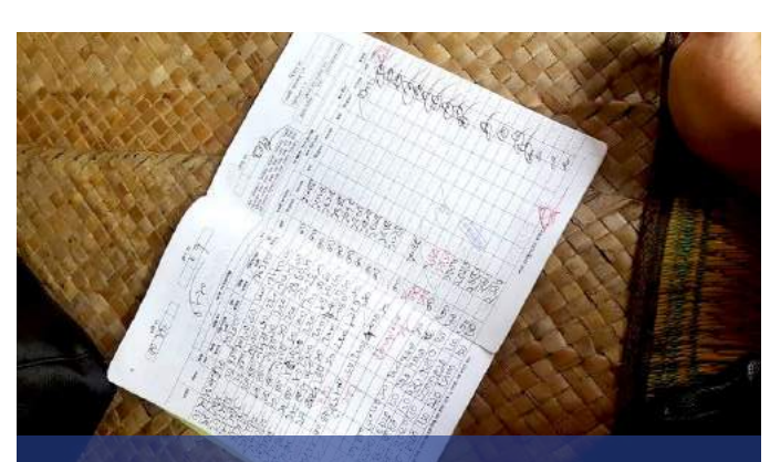
Pass book of the borrowers