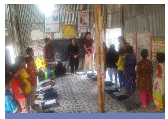
Children receiving informal education at Grameen Shikkha