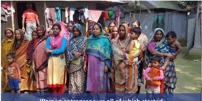
Nomen entrepreneurs all of which started their businesses with micro-credit