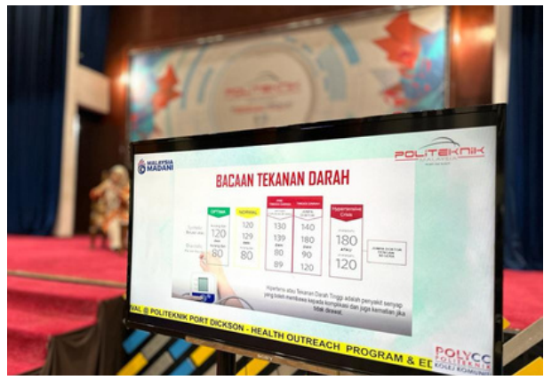
Consent been taken from the participants to use the image for publication purposes