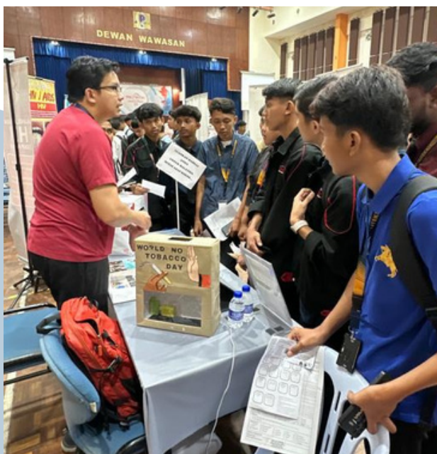
Station smoking and vaping cessation: Educate public on the danger of smoking and vaping and methods of cessations

HOPE-C 2023 served as an essential platform to educate, screen, and promote health awareness within the community. The event's success lay in its comprehensive approach, engaging talks, screenings, and collaborative efforts, aiming to make a tangible difference in combating hypertension and advocating for early cancer detection.