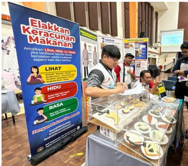
Station food safety and quality: Educate public on importance of food safety and hand hygiene