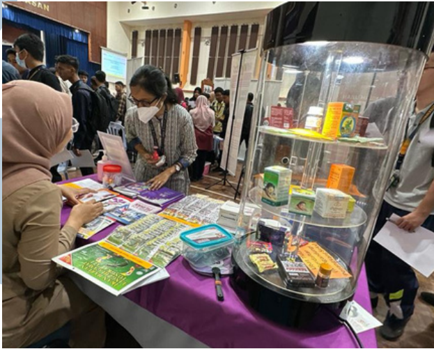
Station pharmacy: Educate public on how to recognize registered and non-registered drugs