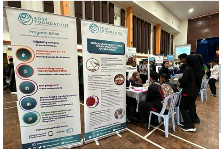
Station ROSE: Educate public on the importance of cervical and breast cancer screening