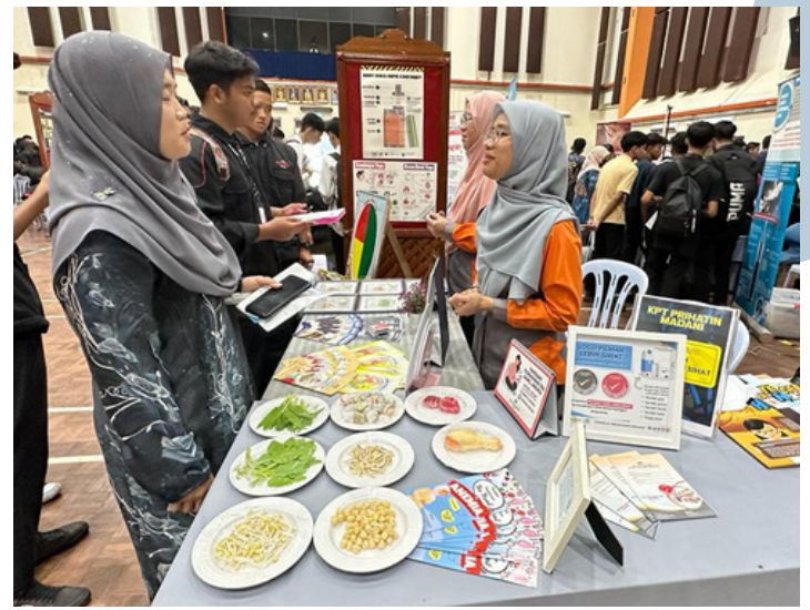
Station healthy diet: Educate public on the importance of healthy food and how to prepare healthy food