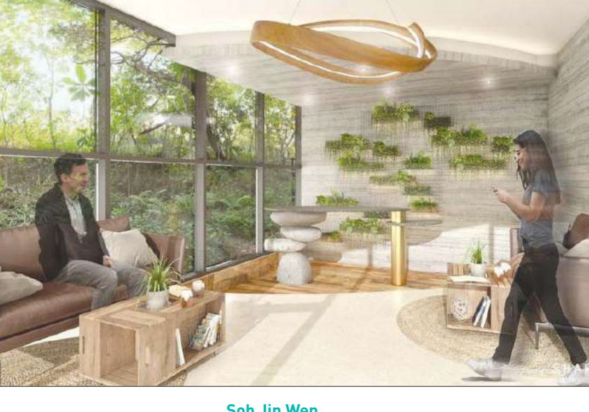
Soh Jin Wen BA (HONS) DESIGN COMMUNICATION