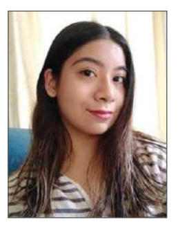
BA (HONS) DIGITAL FILM PRODUCTION