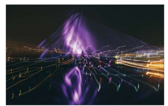
Chan Jing Ning BA (HONS) DESIGN COMMUNICATION

Check out more students' work at: http://university.sunway.edu.my/soashowcase