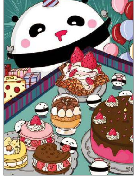
BA (HONS) DESIGN COMMUNICATION