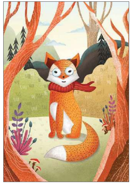
Sheryl Ching BA (HONS) DESIGN COMMUNICATION