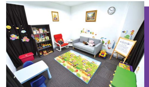
The Sunway Baby Lab located in the Human Development Lab, one of the observation rooms to study how babies understand the world around them