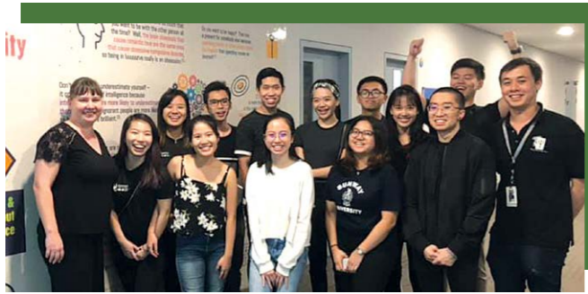
Psychology Day Group photo of the team that conducted experiments and mini tasks on Psychology Day, a platform for pre-university students to find out how psychological theories and principles are applied in our daily lives.