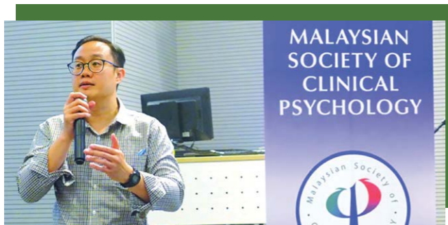
Public forum on 'Responding to Crises: How are Clinical Psychologists Relevant?' . Co-organised with the Malaysian Society of Clinical Psychology