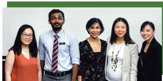
Graduate Trends and Opportunities in Psychology In this forum, industry speakers (2 of which are our Psychology alumni) shared about their career pathways and how psychology is relevant in each of their jobs.

#CampusWithAConscience is an underlying principle that embraces everything you will experience during your time at Sunway Education Group. This is the fundamental spirit at the heart Sunway Campus Life as we educate, encourage, and engage all aspects of our diverse community to adopt a lifestyle and lifestyle habits that truly reflect a society determined to create a better living environment for this generation and generations to come.