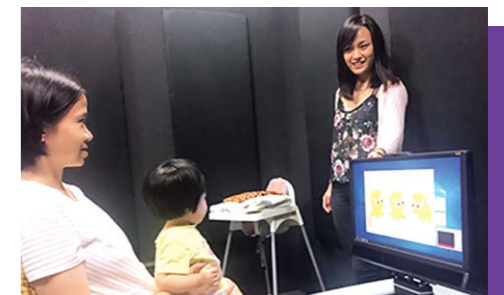
Eye tracker being used to track attention and study visual perception