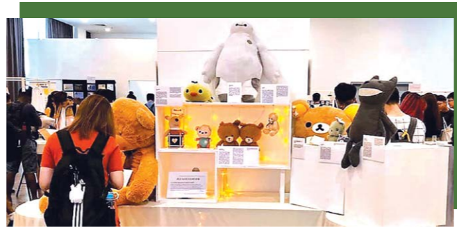
Break-up Exhibition Each item on display comes with a story. This exhibition aims to assist individuals who have faced difficulties within relationships to move on through sharing their stories and related items anonymously.