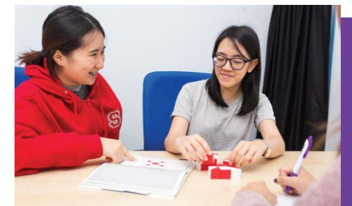
Administering a psychological test at one of the psychology labs