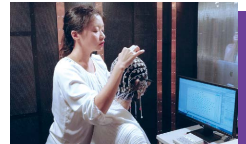
The Human Performance Lab is equipped with an EEG machine used to measure brain activity